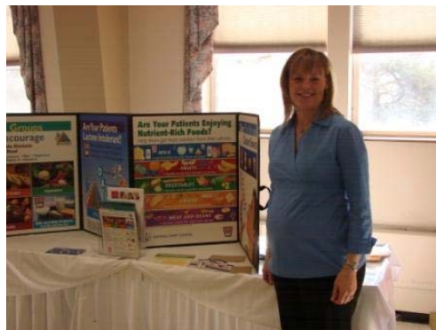
Midwest Dairy Council Exhibitor