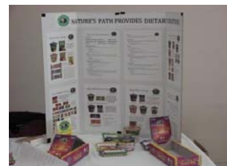
Nature’s Path Booth