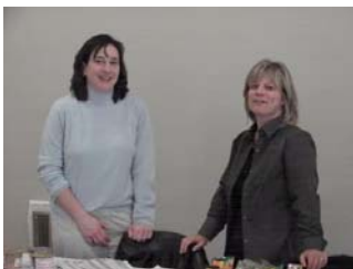
Nature’s Path Exhibitors

A special thank you to the seminar sponsor, ARAMARK Healthcare , and Midwest Dairy Council for their sponsorship of the morning break and their presentation. Other exhibitors included American Dietetic Association, Dominican University, Nature’s Path, Odwalla, and Pfeiffer Treatment Center.